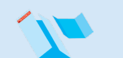
Barn Door Cover