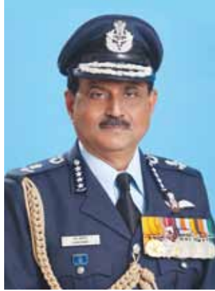
AIR CHIEF MARSHAL NAK BROWNE PVSM AVSM VM ADC

IAF's ongoing transformation phase draws its sustenance from the calibre, commitment and the single-minded focus of our proud men and women who excel in their daily mission. Operating in some of the most challenging and diverse operational environments of the world, they resolutely strive to uphold all the noble values and ideals that truly symbolise the 'air warrior spirit'. Standing at the threshold of a new beginning and looking back proudly at decades of our glorious past, we salute the pioneering spirit and resolute service of our predecessors. It is indeed this pride in our rich legacy which strengthens our resolve to brave the transformational challenges.